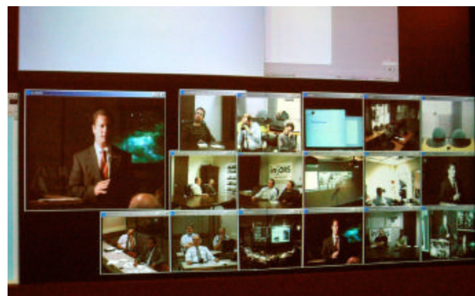
AccessGrid node UC Berkeley